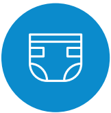
Diapers or Pull Ups