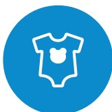
Extra Outfit and a Change of Shoes if Required Please Include Bibs