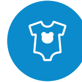
Extra Outfit and a Change of Shoes if Required Please Include Bibs