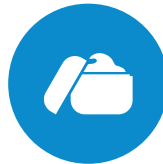
Diaper Rash Cream or Ointment