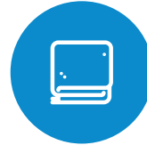
Crib Sheets & Blankets